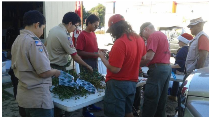
More Packing out