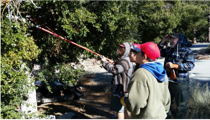
Picking the mistletoe