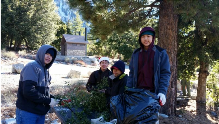
Bulk bagging the product.