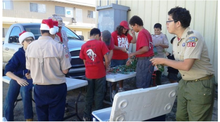
Packing out the mistletoe at the Post