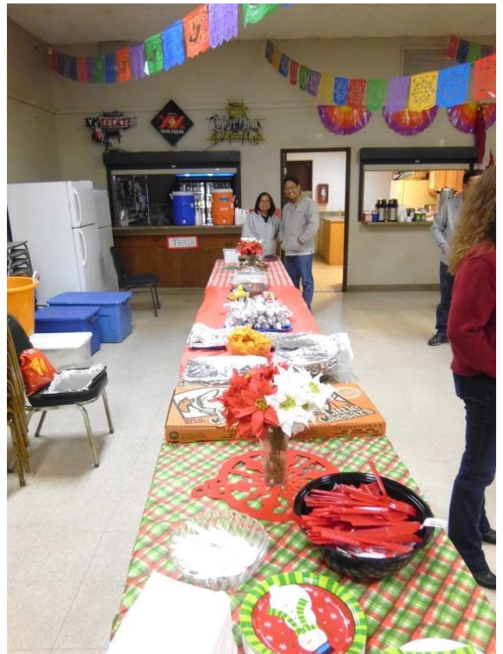
COH Food tables are ready.

TRUSTWORTHY loyal HELPFUL friendly KIND cheerful thrifty brave clean reverent COURTEOUS OBEDIENT