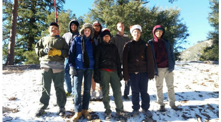
Campers and the Morning Crew pose for picture in the snow.

The next morning we all ate at the Crystal Lake Diner, and were joined by our other scouts.