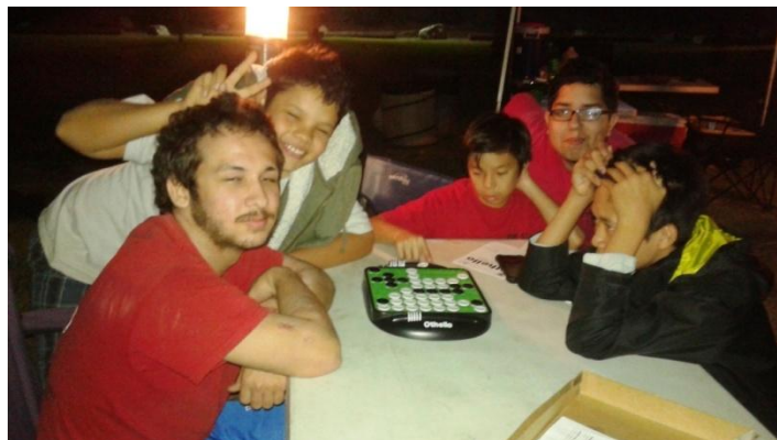
Games were played, Photographic evidence